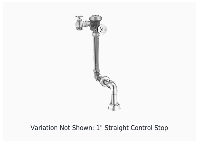
Variation Not Shown: 1" Straight Control Stop